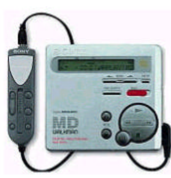
Newer MiniDisc models provide the ability to control remotely and get the maximum value.

Copyright © 2001, Terry Brock, All Rights Reserved Internationally. No portion may be copied or used in any format without the express permission of Terry Brock,