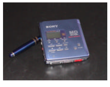
The MiniDisc provides abilities for professional recording on removable discs that a inexpensive and highly versatile.

You'll need to get a microphone that will provide you the ability to record. I purchased a small lavaliere clip-on microphone that provides good quality at Radio Shack. I also have used one that came with another Sony cassette